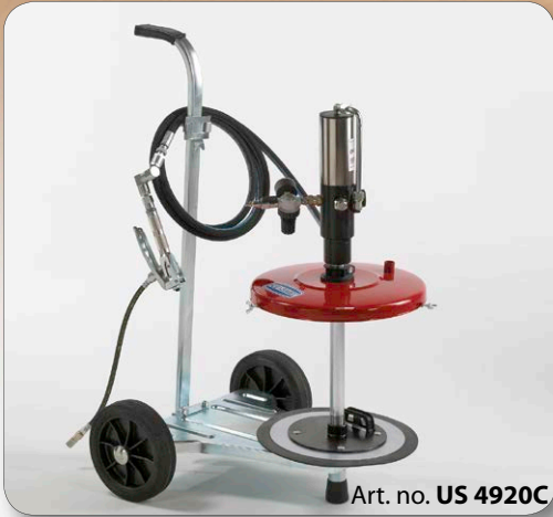
Art. no. US 4920C