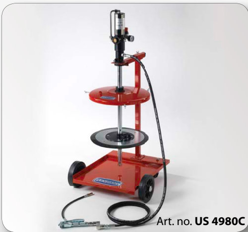
Art. no. US 4980C