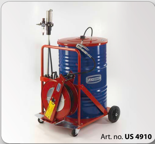
Art. no. US 4910