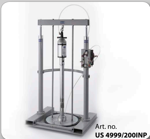
Art. no. US 4999/200INP