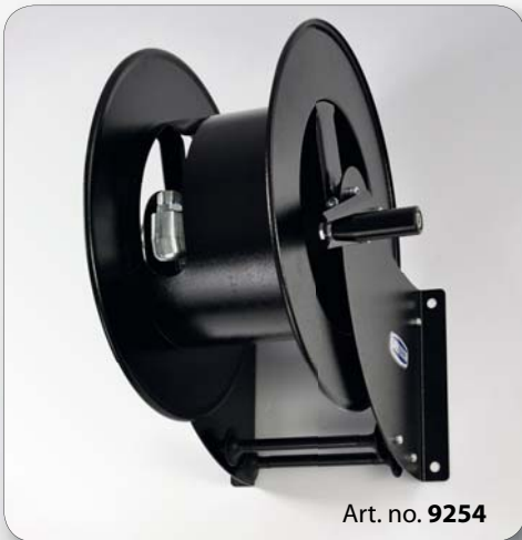
Art. no. 9254

Manual, hand crank hose reel, LS series , in black painted steel, suitable for hoses of max 12 m length in 1" or max 15 m length in 3/4".