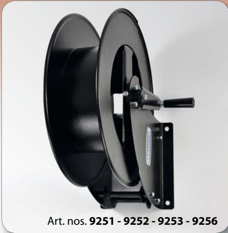
Art. nos. 9251 - 9252 - 9253 - 9256

Manual, hand crank hose reel, LS series , in black painted steel, suitable for hoses of max 50 m length in 1/2".