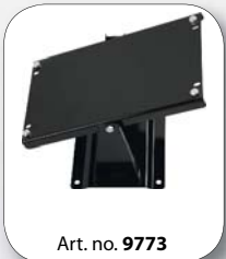
Art. no. 9773 Pivoting wall mounting bracket

Please see catalogue pages 228 and 229 for the selection of the required hoses.