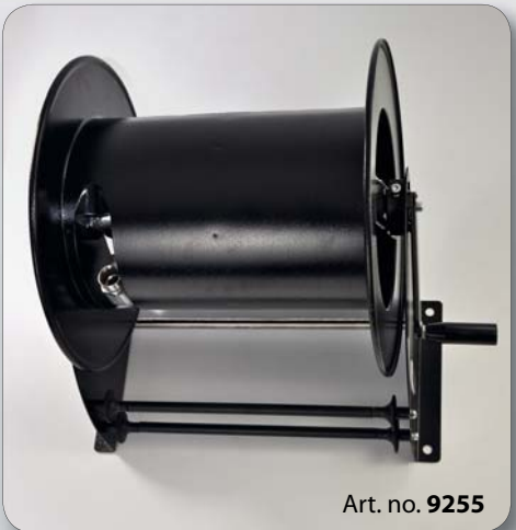
Art. no. 9255

Manual, hand crank hose reel, LS series , in black painted steel, suitable for hoses of max 20 m length in 1" or max 25 m length in 3/4".