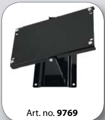
Art. no. 9769 Pivoting wall mounting bracket

Please see catalogue pages 228 and 229 for the selection of the required hoses.